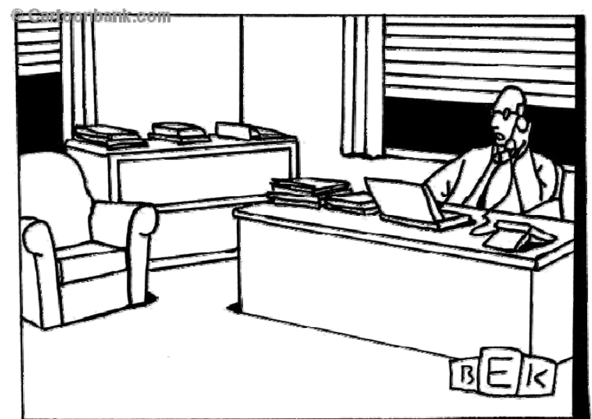
"I just have to create a few loose ends for other people to clear up, and then I can get out of here."

© 2008 Used with paid permission from The New Yorker Collection from cartoonbank.com. All Rights Reserved.